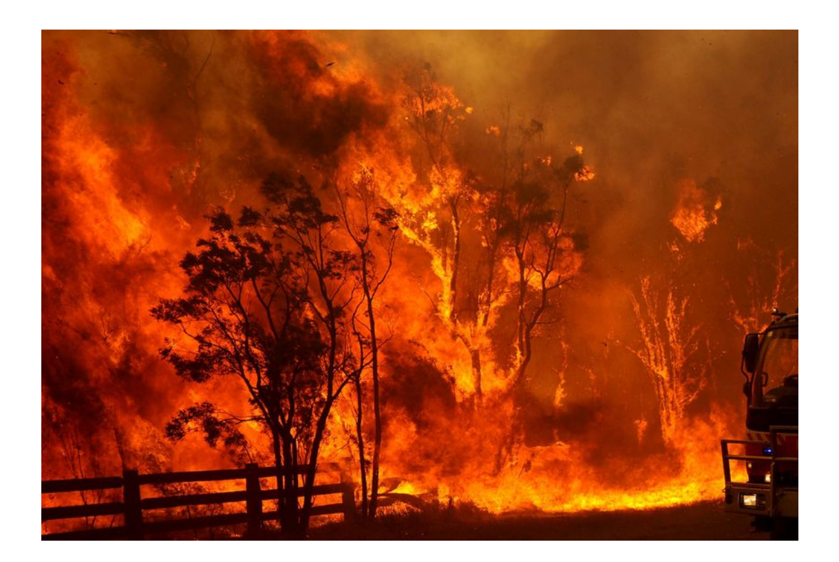
Figure 1: Fast moving fire front

• The fire front. The flames of the fire front (the leading edge of a blaze) ignite anything flammable with which it comes into contact. The most dangerous of all fire fronts is one that burns in the crowns, or tops, of trees (called a running crown fire). In eucalypt forests, bushfires can advance at alarming speeds through the upper layers of the forest. The tops of the trees often appear to explode as the fire roars through. On hot days the oils in eucalypt leaves pass into the atmosphere as a vapour. This vapour is quite flammable. The trees themselves do not explode; instead, it is the oil-rich vapour given off by the leaves that ignites in a fireball.